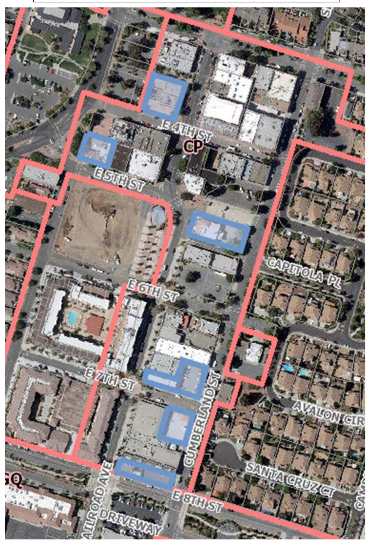
Page 2 of 3